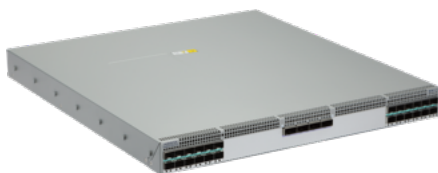
Arista 7050SX3-24YC4C : 24x 25G SFP and 4x 100G QSFP ports

The Arista 7050SX3-24YC4C is a 1RU system that has 24 ports of 25G SFP and 4 ports of 100G QSFP100. The high density SFP ports can be configured to run either at 25G or a mix of 10G/1G speeds. The QSFP ports allow for 100GbE or 40GbE as high speed network uplinks, with a wide choice of transceivers and cables enabling a choice of combinations for both leaf and spine deployment. With low latency and no oversubscription, the switch is optimized for high performance server and storage deployments.