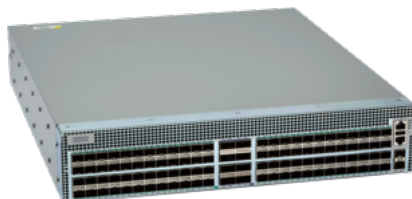
Arista 7050SX3-96YC8 : 96x 25G SFP and 8x 100G QSFP ports

The Arista 7050SX3-96YC8 is a 2RU system with 96 ports of 25G and 8 ports of 100G with an overall throughput of 6.4 Tbps bi-directional. The high density SFP ports can be configured in groups of 4 to run either at 25G or a mix of 10G/1G speeds. The QSFP100 ports allow for a choice of 5 speeds including 100GbE, 40GbE, 4x10GbE, 4x25GbE or 2x 50GbE with a wide choice of transceivers and cables enabling a choice of combinations for both leaf and spine deployment. With low latency and no oversubscription, the switch is optimized for high density server environments with native 25G connections.