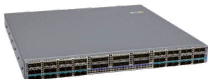
Arista 7050SX3-48YC12 : 48x 25G SFP and 12x 100G QSFP ports

The Arista 7050SX3-48C8 , 7050SX3-48C8C and 7050TX3-48C8 are 1RU systems with 48 port of 10G and 8 ports of 100G with an overall throughput of 2.56 Tbps. The SX3 high density 10G ports can be configured for a mix of 10G/1G speeds to facilitate mixed connections and the TX3 RJ45 ports allows 1G, 2.5G, 5G, and 10G speeds. The QSFP100 ports allow 100GbE or 40GbE as network uplinks, with a rich choice of transceivers and cables for both leaf and spine deployment. With no oversubscription, the switch is optimized for high performance deployments with consistent features.