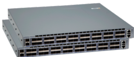
Arista 7050CX3-32S and 7050CX3-32C : 32x 100G QSFP100 ports, 2 SFP+ ports

The 7050CX3-32S and the 7050CX3-32C are 1RU systems with 32 100G QSFP100 ports offering wire speed throughput of up to 6.4 Tbps bi-directional. Each QSFP port supports a choice of 5 speeds with flexible configuration between 100GbE, 40GbE, 4x10GbE, 4x25GbE or 2x50GbE modes for up to 128 ports of 10GbE and 25GbE or 64 ports of 50GbE. All ports can operate in any supported mode without limitation, allowing easy migration from lower speeds and the flexibility for leaf or spine deployment.