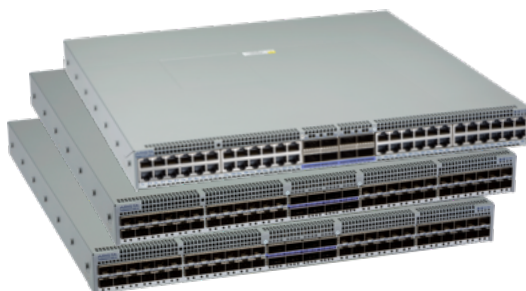
Arista 7050SX3-48C8, 7050SX3-48C8C and 7050TX3-48C8 : 48x 10G SFP or 10GBaseT and 8x 100G QSFP ports

The Arista 7050SX3-48C8 , 7050SX3-48C8C and 7050TX3-48C8 are 1RU systems with 48 port of 10G and 8 ports of 100G with an overall throughput of 2.56 Tbps. The SX3 high density 10G ports can be configured for a mix of 10G/1G speeds to facilitate mixed connections and the TX3 RJ45 ports allows 1G, 2.5G, 5G, and 10G speeds. The QSFP100 ports allow 100GbE or 40GbE as network uplinks, with a rich choice of transceivers and cables for both leaf and spine deployment. With no oversubscription, the switch is optimized for high performance deployments with consistent features.