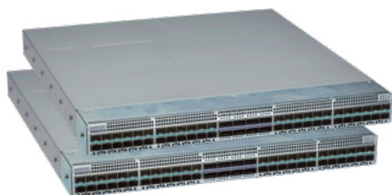
Arista 7050SX3-48YC8 and 7050SX3-48YC8C : 48x 25G SFP and 8x 100G QSFP ports

The Arista 7050SX3-48YC8 and the 7050SX3-48YC8C are 1RU systems with 48 ports of 25G SFP and 8 ports of 100G QSFP100 with an overall throughput of 4 Tbps. The high density SFP ports can be configured to run either at 25G or a mix of 10G/1G speeds. The QSFP ports allow for 100GbE or 40GbE as high speed network uplinks, with a wide choice of transceivers and cables enabling a choice of combinations for both leaf and spine deployment. With low latency and no oversubscription, the switch is optimized for high performance server and storage deployments.