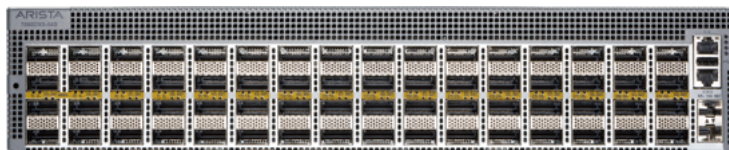
Arista 7060DX5-64S: 64 x 400GbE QSFP-DD ports, 2 SFP+ ports