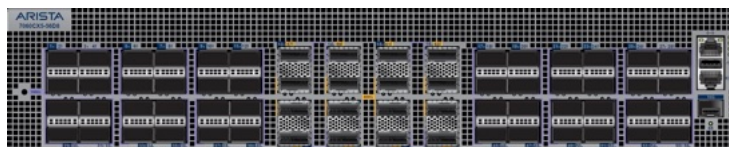
Arista 7060CX5-56D8: 56 x 100G QSFP-DD, 8x 400G QSFP-DD ports, 1 SFP+ port