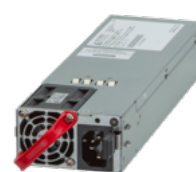
2.4kW Hot swap power supplies