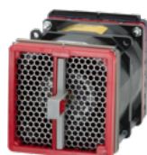
2U Hot swap fan modules