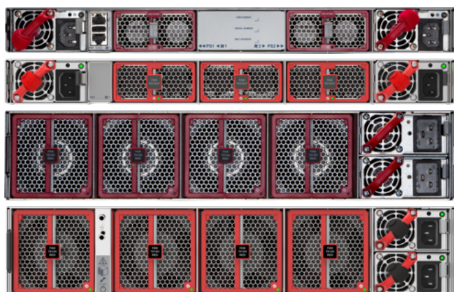
Arista 7280R3A 1 and 2RU Rear Views AC Powered, Front to Rear airflow (red)