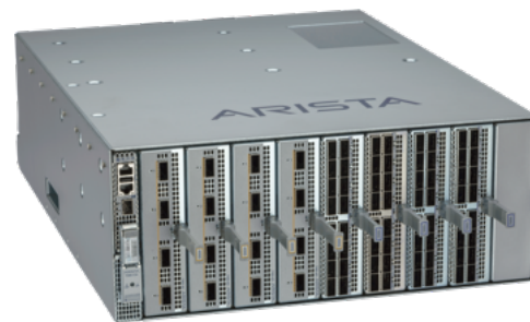
Arista 7368X4: 128 ports of 25G or 100G, or 32 ports of 400G

Combined with Arista EOS the 7368X4 series deliver advanced features for hyper-scale networks, server-less compute, big data farms and machine learning clusters.